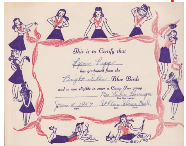
Some names are inspired by nature: a certificate from the Bright Star Blue Bird Group, 1957

Although there are many traditions for choosing club names, members are encouraged to be creative in selecting a name that is meaningful to the group, fits their unique identity and serves to proudly declare their place in the larger community that is Camp Fire.