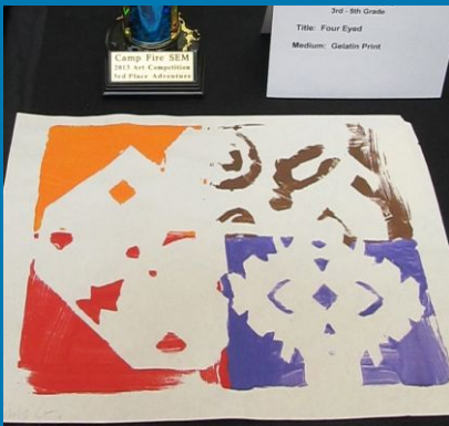
3rd - 5th Grade Title: Four Eyed Medium: Galatin Print Camp Fire SEM 2013 Art Competition People's Choice Award