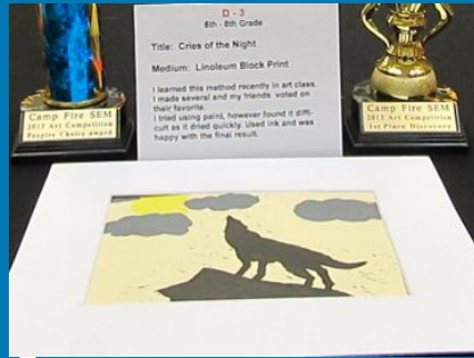
D - 3 6th - 8th Grade Title: Cries of the Night Medium: Linoleum Block Print I learned this method recently in art class. I made several and my friends voted on their favorite. I loved using paint, however found it difficult as it dried quickly. Used ink and was happy with the final result.